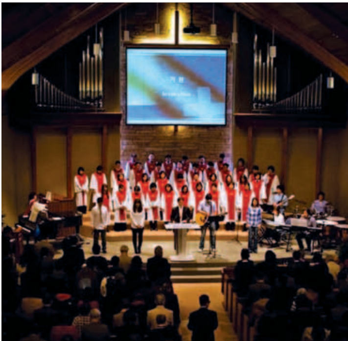
The choir at Pyung An Presbyterian Church in Auburn, WA

The racial ethnic membership of the Presbyterian Church (U.S.A.) has increased, but we still have work to do to grow new, diverse communities of faith, keeping in mind our calls to social justice and antiracism. The whole church is called to this ministry as we welcome the stranger, invite diverse peoples to church, share good news, and work to become the beloved community of God.