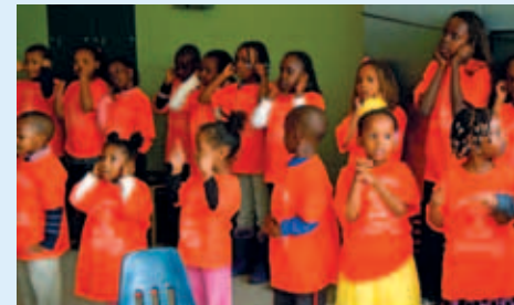
A children's group at Neema Community Church

The most recent church chartered in the PC(USA) is Neema Community Church in Overland Park, KS, an African New Church Development that began as a Bible study with eight people in a pastor's home.