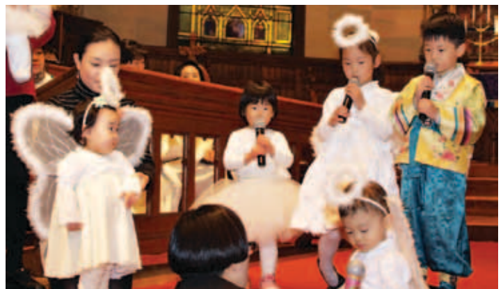
The youngest members of Top Stone Church in Englewood, NJ, take part in worship services.