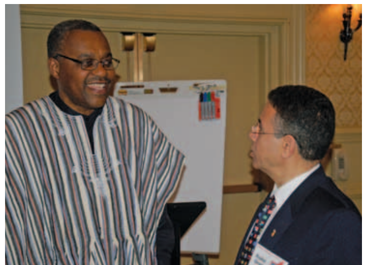
GAMC staff is tasked with igniting a movement to create 1,001 New Worshiping Communities.

In Racial Ethnic & Women’s Ministries, we seek to embody some of the characteristics of the new community of faith as seen in the Acts passage. We also embrace the Pentecost moment described at the beginning of Acts 2, where there were Africans, Asians, Middle Easterners, and others who crossed cultures and, though they spoke different languages, understood each other, as they were all talking God’s language and giving witness to the great things that God had done.