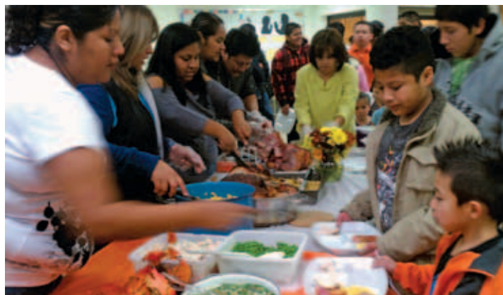
A community meal at the Camino de Vida Worshipping Community in Albuquerque, NM