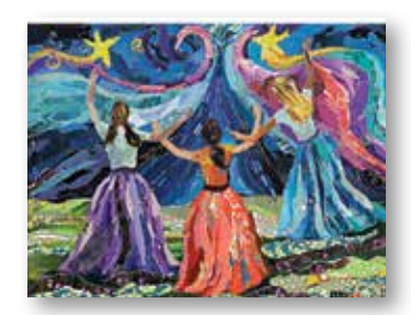
Celebrate the Gifts of Women 2014

Celebrate the Gifts of Women honors "diverse sisters in God's household." The resource is available in the November/December issue of Horizons magazine, and the downloadable resource and bulletin cover are available from pcusa.org/women, and free from Presbyterian Distribution Service (PDS)—800-524-2612 or pcusa.org/store item number 27501-14-001.