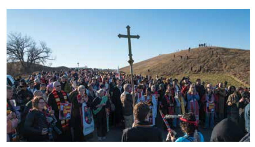
Over 500 clergy and faith leaders joined Native American activists for the Nov. 3, 2016 "Clergy Standing with Standing Rock" near Cannon Ball, North Dakota.