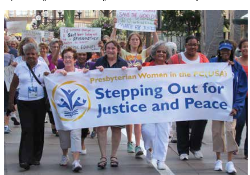
Presbyterian Women participating in a march for peace and justice for all women.

And the Women's Orientation breakfast will be held at GA on Saturday, June 16, from 7:00 — 9:00 a.m. at the Marriott Grand in St. Louis. Connect with women who are working to take us to a time of accountability and equality. Gain wisdom and insights while interacting with the co-moderators of the 222nd GA (2016) and discover how the voices of women will be heard at General Assembly. To read the joint statement on sexual injustice issued by Presbyterian Women and the Advocacy Committee for Women's Concerns, go to: www.pcusa.org/genderandleadership).